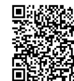
Don't Risk It